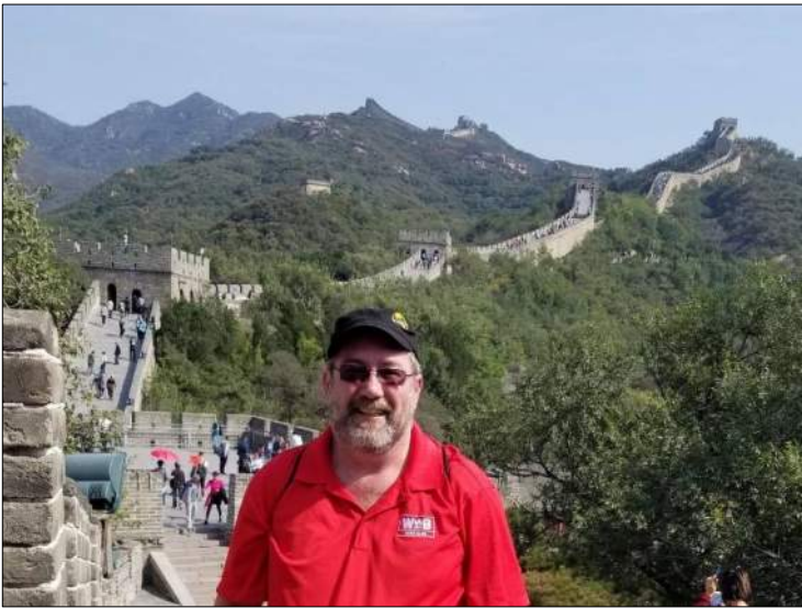
Of course you can't go to China without visiting some of the sites, like the Great Wall and Forbidden City.

The sponge city initiative is similar to low-impact development (LID) or green infrastructure (GI) efforts in the United States. While much of the efforts in China are focused on new urbanization, there is also a focus on retrofits to existing urban areas. The Chinese government has called for existing urban areas to incorporate water management best practices in redesign and retrofitting projects.