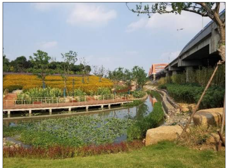
A Nanjing, China "sponge city" site. This floodplain restoration project is adjacent to a road that repeatedly flooded.

On the final day of the conference, we visited two sponge city project sites in Nanjing. The first was a floodplain restoration site adjacent to a road that repeatedly flooded. A vacant adjacent lot was remediated to expand the