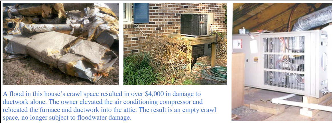
A flood in this house's crawl space resulted in over $4,000 in damage to ductwork alone. The owner elevated the air conditioning compressor and relocated the furnace and ductwork into the attic. The result is an empty crawl space, no longer subject to floodwater damage.

g. Elevate your utilities: Heating, air conditioning and electricity are vital utilities to make a building livable. If they are knocked out, it will delay repairing, rebuilding and reoccupying. One way to protect these utilities is to elevate them above the flood level, as in the example, below. Don't forget to elevate electrical outlets, too.