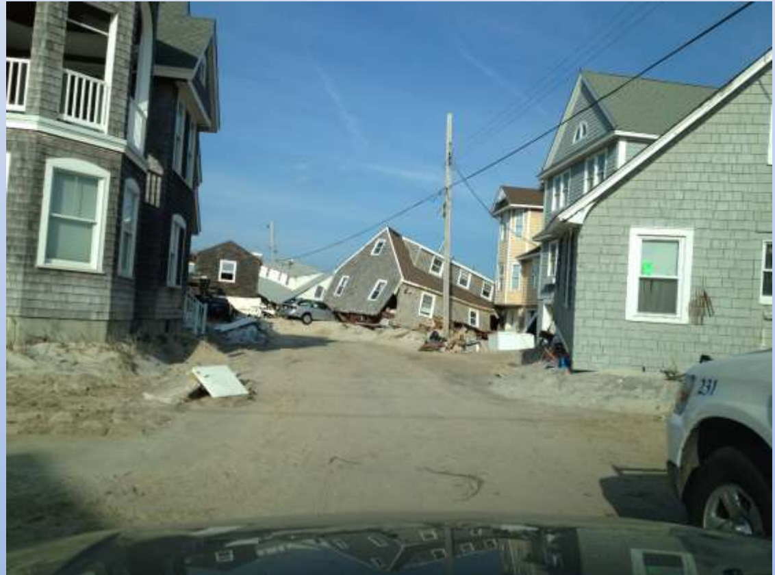
TYPICAL PRE-FIRM BUILDING DAMAGE