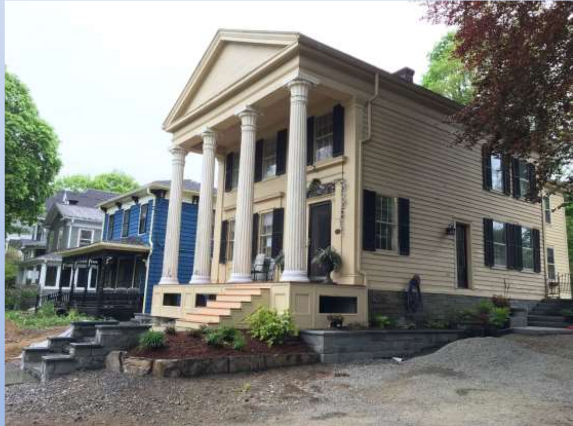
HISTORIC ELEVATION 4ft