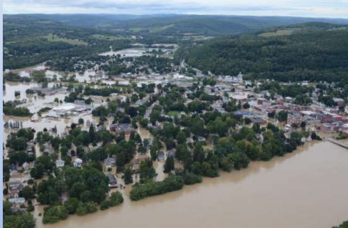
VILLAGE of OWEGO, NY