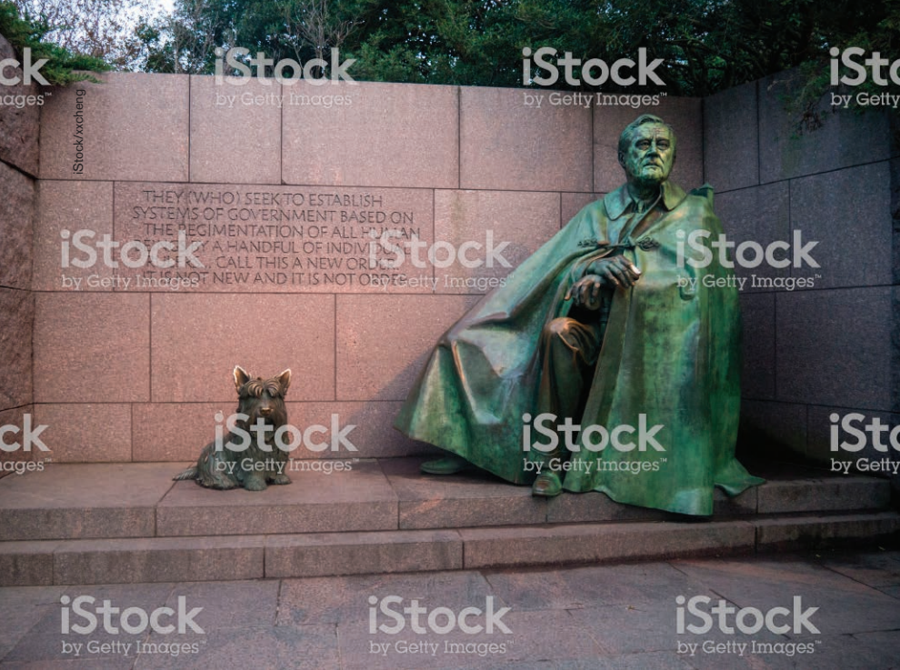
19 Words from one of White's memorandum to FDR used in his January 1935 Message 20 to Congress on Natrual Resources is inscribed on the wall of the FDR Memorial in 21 Washington D.C.

22 23 24 25 26 27 28 29 30 31 32 33 34 35 36 37 38 39 40 41 42 43 44 45 46 47 48 49 50 51 52 53 54 55 56 matism still infused the Lab School and college during Gilbert's student years. James Wescoat identifies four themes shared by Dewey and White in their respective intellectual lives: (1) the precariousness of existence; (2) the pragmatic conception of inquiry; (3) learning from experience; and (4) discourse and democracy. 4