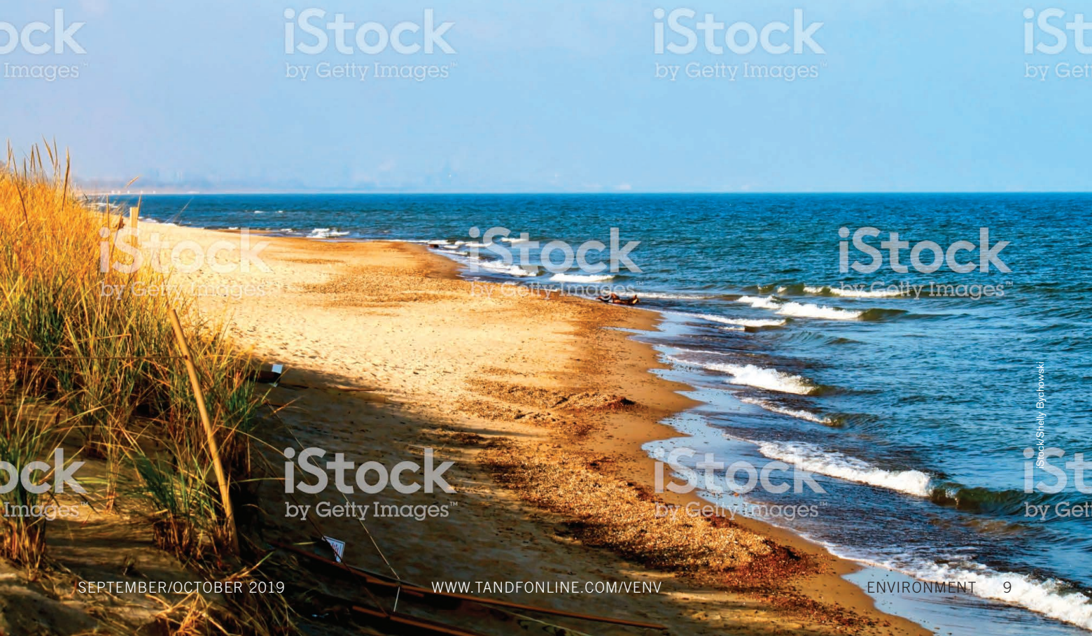
Indiana Dunes National Park.