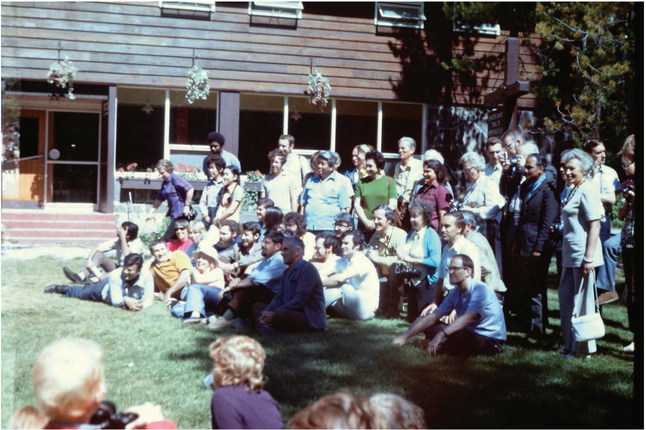
IGU Field Trip to Alberta, Canada with contributors to the volume Natural Hazards: Local, National, Global edited by Gilbert F. White.